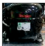
High Performance Compressor