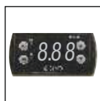
Digital Controller with Audio Visual Alarm