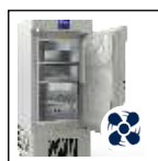
Low Noise Design