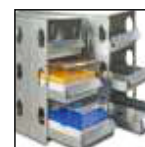
Cryo Racks & Boxes