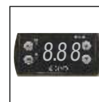
Digital Controller with Audio Visual Alarm