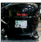
High Performance Compressor