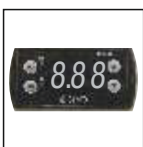
Digital Controller with Audio Visual Alarm

Circular chart recorder To archive data points over a time interval