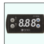
Digital Controller with Audio Visual Alarm