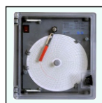
Circular Chart Recorder