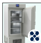
Low Noise Cooling System