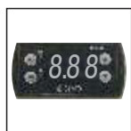
Digital Controller with Audio Visual Alarm