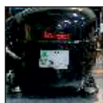
High Performance Compressor