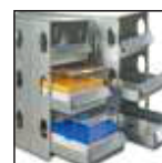
Cryo Racks & Boxes